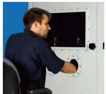
Instrument access via airtight gauntlets and viewing panel