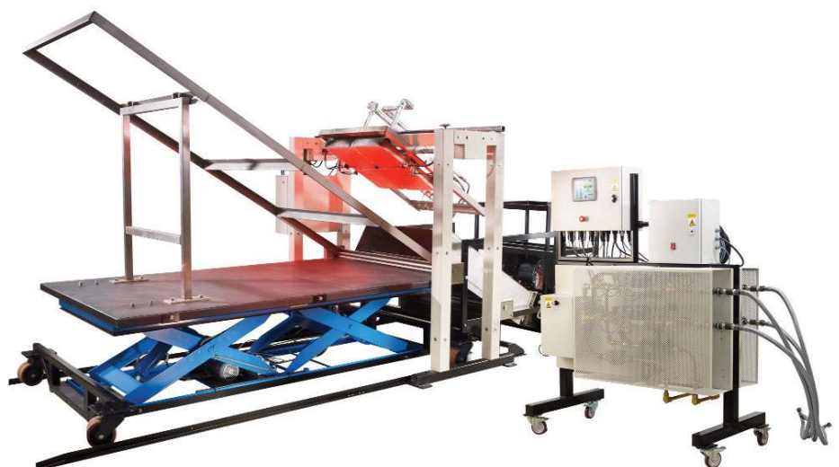
The Main Frame on the left includes Radiant Panel Assembly, 4 Flexible Gas Burner Hoses, Sparker Box, Guide Rails and Guide Rails Extensions. On the right is a Dual Diverter Stand and Control Box Assembly.

The Air Nozzle Blower Assembly is positioned behind the Sample Assembly so that a uniform airflow is applied over the surface of the test sample. The air velocity is established using the anemometer according to the requirements