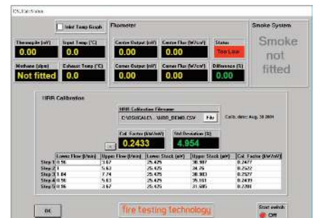
The software interfaces with the OSU apparatus via a data logger system, into which all the required signals are connected