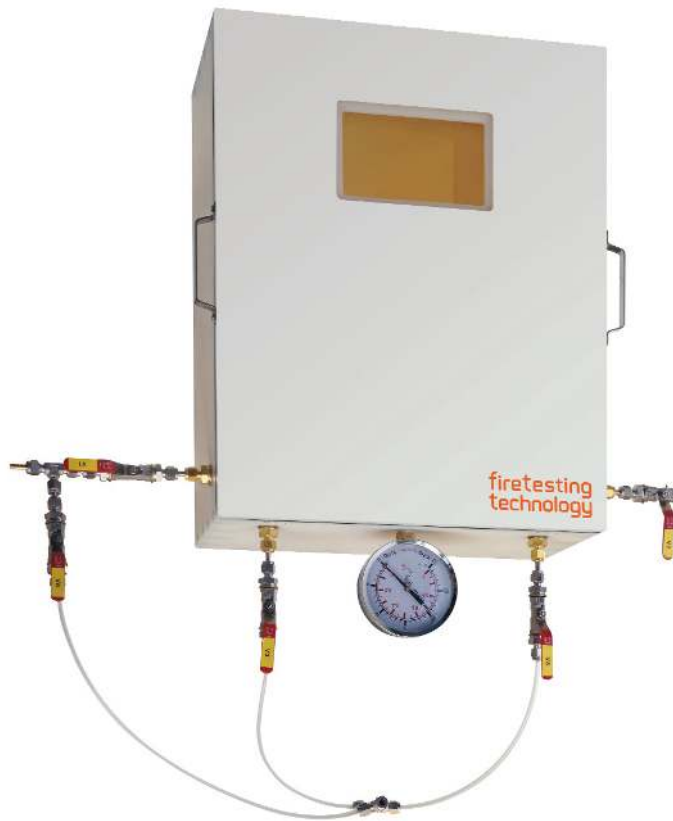
ABD0031 Vacuum Box

The NES 711 attachment comprises a spark ignition burner and stirrer fan. The FTT SmokeBox software is compatible with this option.