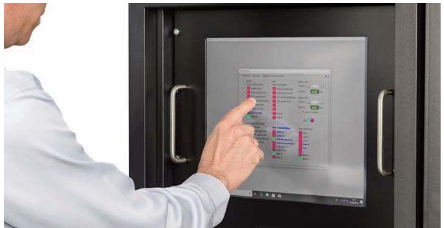
17" touchscreen PC and ConeCalc software

conventional cone assembly but uses the same controllers as the normal cone. There is a door on the front of the assembly with a viewing window. Changing between the standard fire model and this unit is simple.