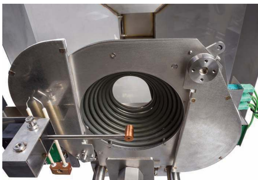
Base view of conical heater