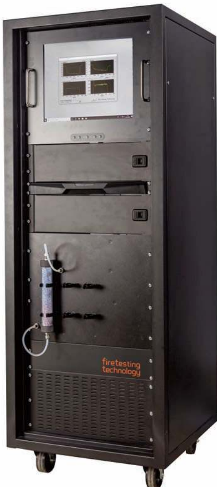
Gas Analysis Rack

All modern heat release measurements use oxygen consumption calorimetry. The analysis and instrumentation used for quantitative oxygen, carbon monoxide and carbon dioxide measurements in both large and small calorimetry have similar specifications. Thus a single set of instrumentation can be used for many tests. FTT's iCone plus houses the common gas analysis instrumentation, higher capacity pumps and gas handling filtration required for Large Scale Calorimeters [e.g. ISO 9705, Furniture Calorimeters, Cable Propagation Rigs (EN 50399), SBI Apparatus (EN 13823)] in a