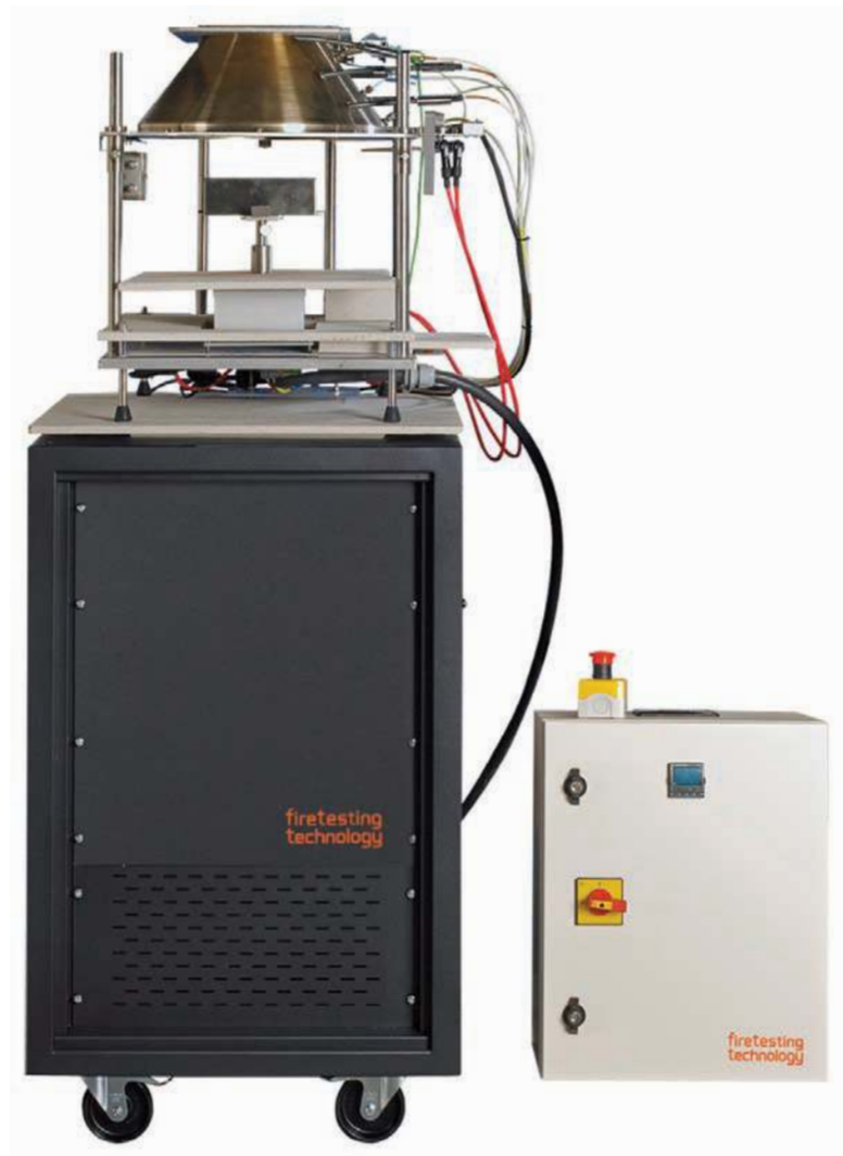
Large Cone Fire Model and Control Unit

The Cone Calorimeter is fitted with a gas mixing attachment to mix air and nitrogen which can be supplied at flows between 0-200ℓ/min to the chamber. The gas supply lines are fitted with flow meters and flowstat