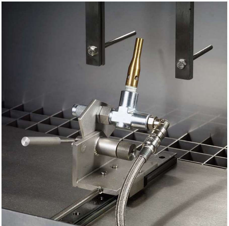
Fully Adjustable Burner

The specimen holders are capable of housing the specimens up to and including 60 mm thick. The FTT ignitability apparatus is supplied with one specimen holder. Optional extras: multi-layered and loose fill materials.